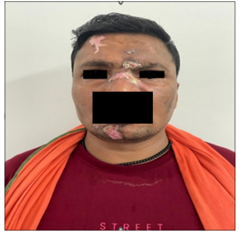
Figure 1: Wounds in different stages of healing at week 1. (Multiple well defined erosive areas of size varying 0.5 \times 0.5 cm to 4 \times 3 cm, presented over forehead, above nasal ridge and chin).

BPD is characterized by a pervasive pattern of instability in interpersonal relationships, self-image, and emotional regulation, with marked impulsivity being a central feature. Deliberate self-harm in DA, however, is driven more by underlying negative emotional states. A cognitivebehavioral approach, combined with a passive yet empathetic psychiatrist-patient relationship, is often more effective in managing these patients.<sup>[6]</sup> Furthermore, pharmacological treatment differs between the two conditions. While stress and anxiety in DA generally respond well to selective serotonin reuptake inhibitors, great caution must be exercised when treating patients with BPD to avoid triggering mood disturbances or causing switching.