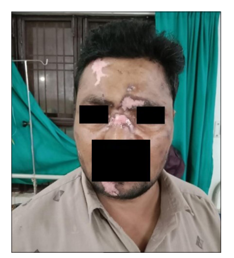
Figure 2: Wounds in different stages of healing at week 4. (Multiple erosive areas with healed granulation tissues surrounding hyper-pigmentation of size varying 0.5 \times 0.5 cm to 4 \times 3 cm present over forehead, above nasal ridge and chin).

In our case, we carefully excluded other psychiatric disorders and serious conditions through detailed clinical and psychometric evaluations, including the use of the International Personality Disorder Examination Screening Questionnaire. This thorough approach was essential for both accurate diagnosis and effective management.