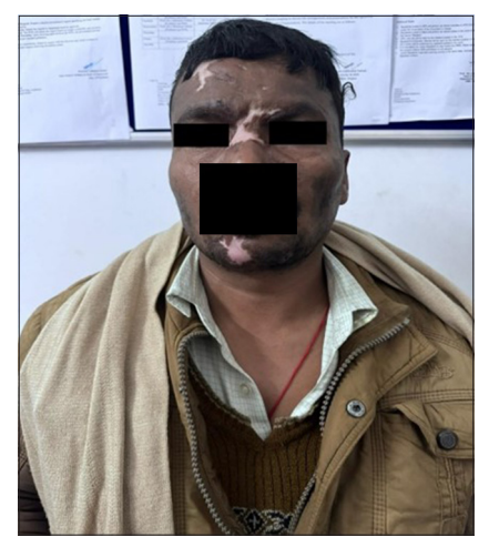
Figure 3: Wounds in different stages of healing at week 8. (Decrease in erythema and increased granulation tissues in all erosive lesions with re-epithelialization in erosive lesions of forehead and chin).

they look beyond the surface when diagnosing. Early recognition and appropriate management of DA can lead to a favorable outcome.